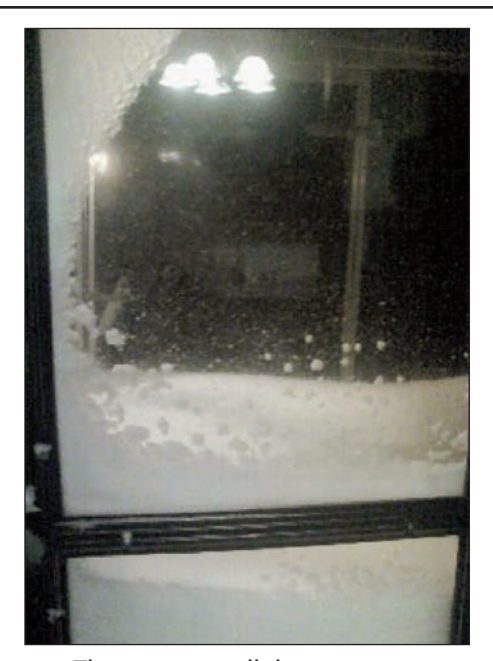
The snow was all the way up to the middle of this screen door. Had to go out the window and shovel before we could use the door!